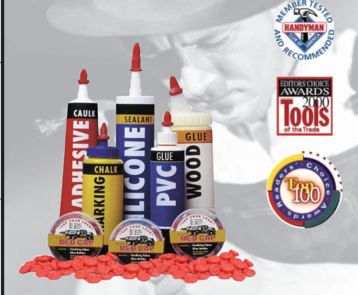
.....See many other applications on our web site at www.littleredcap.com