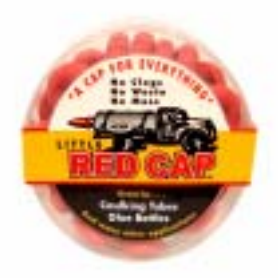
Cannister - LRC.1 (approximately 35 caps)