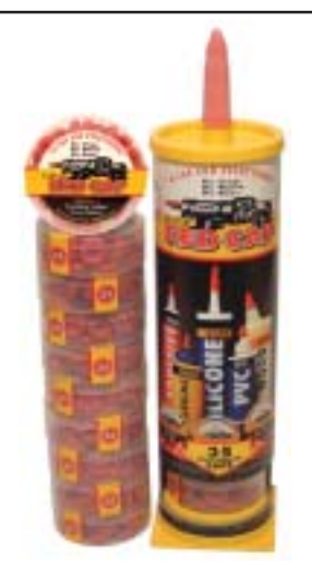
P.O.P. Display - LRC.POP (Includes 10 canisters)